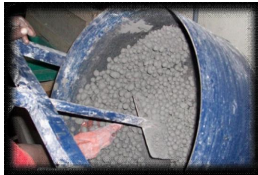
Fig 1: Formation of Fly Ash Pellets

Here, in this pilot study, fly ash aggregates are formed by cold bonded technique. Cold bonding is nothing but normal water curing. Pelletizer of 0.55 m in diameter and 0.250 m depth with a rotating speed of 40 rpm is used in the process of pelletization (Figure 1). An angle of 55° is maintained as per previous studies which give better pelletization efficiency and good grading of pellets [10].