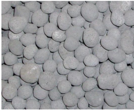
Figure 2: Fly Ash Pellets

The flyash aggregates are porous material and to improve the strength of the pellet the binder material like cement, lime is added. The percentage of binder content is taken by the weight of fly ash. Hardening the pellets is done by various process namely cold bonding, sintering and autoclaving. Cold bonded fly ash aggregates are hardened by different curing process namely normal water curing, steam curing and autoclaving. Autoclave and steam curing method is less effective to improve the properties of aggregate as compare to normal water curing method. The curing method is more important to enhance the aggregate strength. Hence, a normal water curing method can be adopted. The fly ash aggregates were taken out from the pelletiser and allowed to dry for a day. The dried aggregates were cured in the water tank for 28 days.