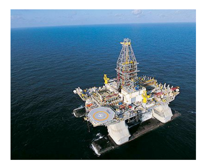
Figure 1b: Deepwater Horizon semisubmersible rig[1]