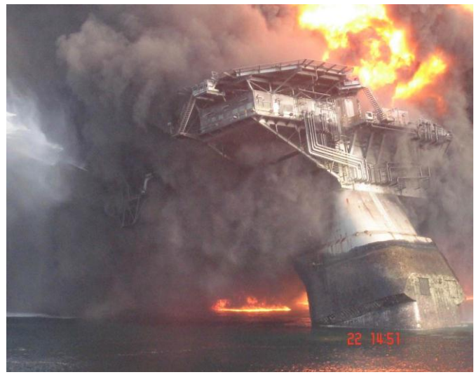
Figure 1c: Macondo Well Blowout [1]