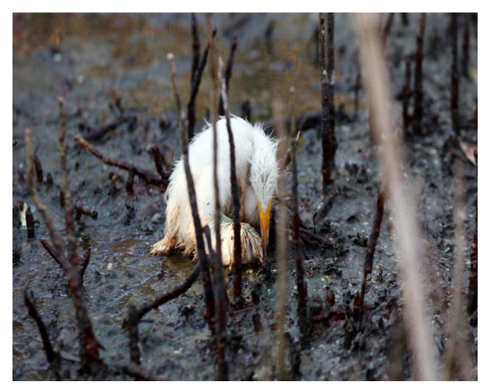
Figure 1d: Environmental impacts on fauna and flora[1]

In the industry, GAP Analysis is an effective and cost efficient tool to identify key components, processes or procedures that need immediate attention or improvement. They are mainly used as a benchmark prior to maintenance activities, recertification or upgrading of existing system or part of a system. It is usually performed for every item of given recommended practice/ standard and codes.