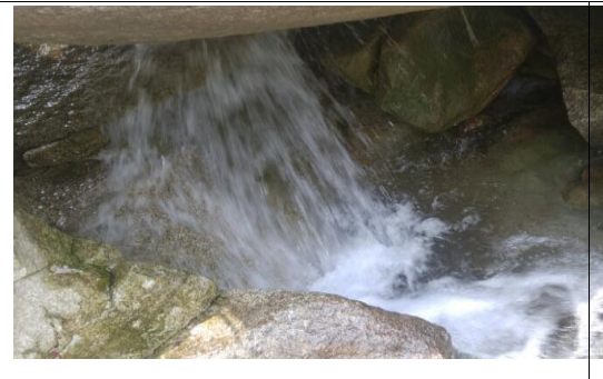
e. Valley 5 - Valley under the Rock

The d in Figure 1 is named a twin valley where the water of the valley, which flows down both sides, falls apart from the rocks. The water flowing in both directions falls down holding the sound of each stream as it is, making each stream narrow but cool and clear.