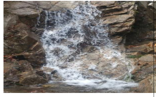
b. Valley 2 – Wide vertical valley

The b in Figure 1 is named a wide vertical valley flowing vertically. The wide vertical valley spreads 90 degrees wide and falls straight off the sloping rock surface, creating a sound that cools the surrounding air and cools the summer heat.