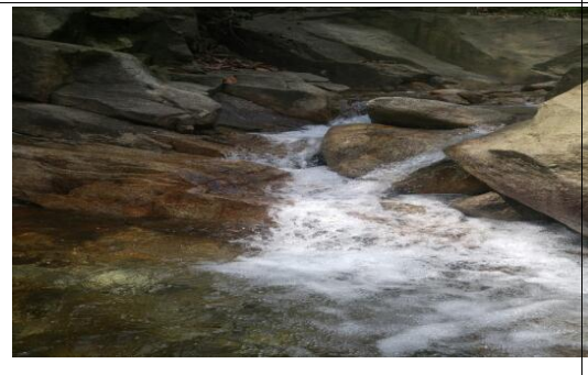
c. Valley 3 - cross valley

The b in Figure 1 is named a wide vertical valley flowing vertically. The wide vertical valley spreads 90 degrees wide and falls straight off the sloping rock surface, creating a sound that cools the surrounding air and cools the summer heat.