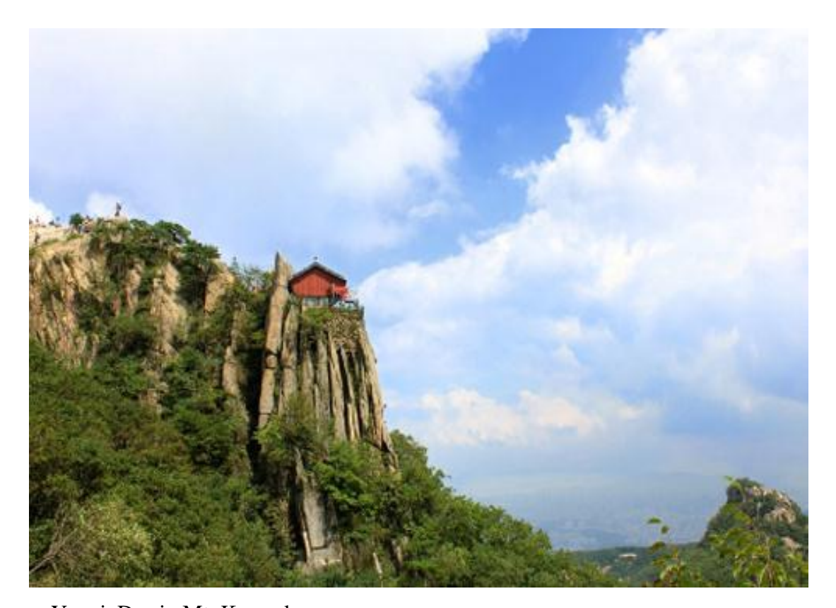
a. YeonjuDae in Mt. Kwanak