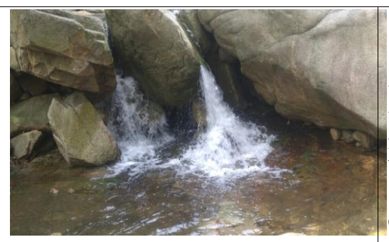
d. Valley 4 - twin valley

The d in Figure 1 is named a twin valley where the water of the valley, which flows down both sides, falls apart from the rocks. The water flowing in both directions falls down holding the sound of each stream as it is, making each stream narrow but cool and clear.