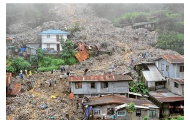
Fig. 2: Deadly garbage slide in Manila post heavy rainfall (2011).

Another type of hazard that cannot be neglected is what is so called secondary hazard, which is a hazard that occurs due to a former natural hazard. For example, a fire arising from drought or lightening, or landslides due to heavy rain, or disease spread due to floods, as in Figure 2. The severity of the impact of the secondary hazard may sometimes exceed that of the primary hazard. Therefore, a multi-hazard approach must be adopted to inform better risk management [2].