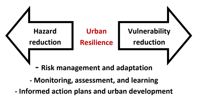
Figure 4: Illustration of the concept of urban resilience Source: Author

Figure 3: Illustration of the relation between hazard, vulnerability, and disaster risk Source: Author