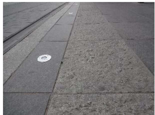
Picture14: In Jerusalem

Unique tiles were installed on the platform of a street car stations in Jerusalem. The platform of a street car station is long (Picture 13). Along the long length, coarse rocks, unlike the dot shaped blocks as seen in Japan, were installed at 20cm from the edge of the platform as warning blocks (Picture 14). These rocks were used only on the platform of the street car stations in Jerusalem. Also, directional blocks were installed on the platform to indicate the street car doors (Picture 15). Directional blocks are not installed at all the doors, but one door per cart.