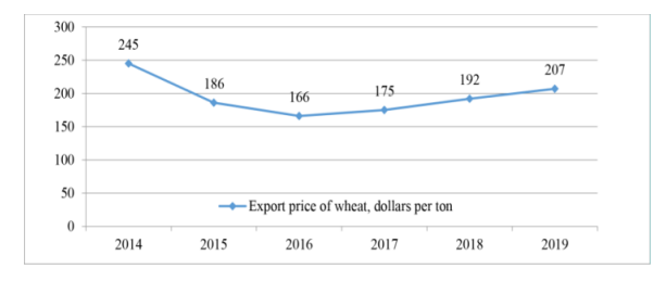
Figure 2. Dynamics of average export prices for wheat, dollars per ton (Monitoring the economic situation in Russia: trends and challenges of socio-economic development, 2019).

years (2017-2019), with the indicators of three years at the beginning of the analyzed period (2011-2013) shows that the volume of grain exports grew by 2.1 times, and the increase in export earnings amounted to only 1.8 times. The trend lines show that this trend will continue due to lower unit prices, i.e. an increase in the supply volume of products for export, an increase in supply on the market is accompanied by a decrease in prices. It should be noted that in Russia, the main export product is wheat. In the structure of export grain, it occupies 82% of the total volume. Outstripping growth in wheat production and supply compared with the dynamics of demand in the domestic and foreign markets has an opposite effect on export prices. In particular, the average price of wheat in the world market, peaking in 2014 - $ 245, steadily decreased in subsequent periods, and in 2019 amounted to $ 207 (Fig. 2) (Monitoring the economic situation in Russia 2019).