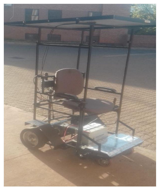
Figure 3: Solar-powered wheelchair