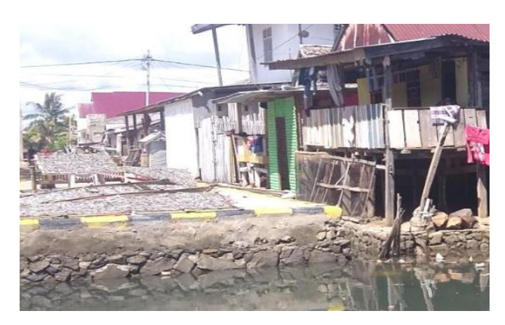
Figure 2. Building and Settlement Conditions for Study Objects

The construction of community houses in the dominant research location is made of wood with zinc roofs, and the building structure uses central wooden poles in the form of stilt houses. The house's shape is deliberately made high or with a house on stilts to avoid flooding when the river overflows. The distance between one place and another is classified as tight so that sunlight and air circulation are minimal. The building landscape is also not well ordered, so that this condition causes the appearance of the research area to look slum. Requirements for constructing buildings according to government regulations regarding the distance from the road line are not obeyed. In building houses, people have not followed government regulations, such as building permits. The condition of the community houses can be seen in Figure 2. The distance between the places is very close and from the road so that the land for making septic tanks is minimal. Limited land on the home page causes the distance between clean water sources and septic tanks to be close together.