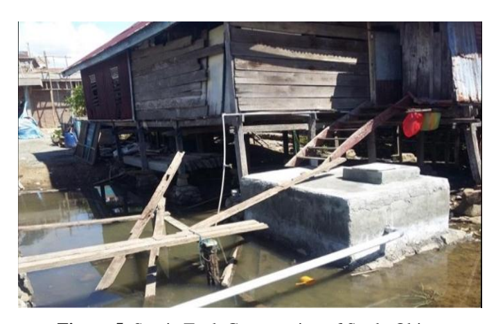
Figure 5. Septic Tank Construction of Study Object