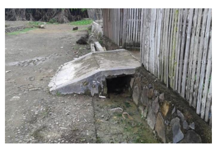
Figure 4. Drainage Conditions of Study Objects

Figure 4 illustrates the drainage construction condition made by digging the soil and not using concrete as the base for the sub-surface drainage. Regarding the shape of the object of study, we also describe the condition of the water below. Water is one of the essential needs for the survival of humans and other living things; as a limitation, clean water is water that meets the requirements for a drinking water supply system. The purpose of the clean water supply system is to distribute/supply clean water to consumers in sufficient quantities, especially in the Lappa area. Difficult water sources due to river flow inundating the Lappa area and frequent flooding caused by overflowing rivers have spurred the community to make deep bore wells. Apart from that, another supply of drinking water also comes from the government, the community's primary daily water source. MCK (shower-wash-toilet) is the immediate daily need for all humans. The organization generally uses rivers to facilitate these needs. Food waste and feces are discharged directly into the river. The habit of disposing of garbage now into the river or around the house is