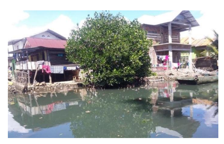
Figure 5. Housing Areas in Watershed

The construction of the septic tank is watertight to avoid contaminating the surrounding environment from fecal waste. The ideal septic tank building distance from a water source is at least 10 meters. The Septic tank is located in such a way as to allow the smooth flow of wastewater from the building to the catchment area and is also equipped with an absorption tank.